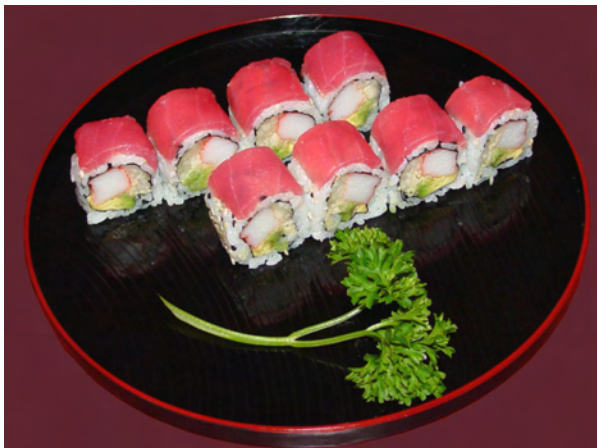
Red Sox Roll

American Dream – Crabmeat, Eel, Shrimp, Cream Cheese, lightly-fried Seaweed and the Chef's Tasty Cooked Sauce, topped with Flying Fish Roe..... $11.95