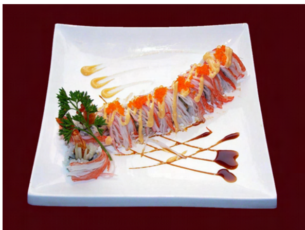
Tiger Shrimp Roll

Caterpillar Roll – Grilled Eel & Cucumber rolled in the shape of a Caterpillar with Avocado..... $11.95