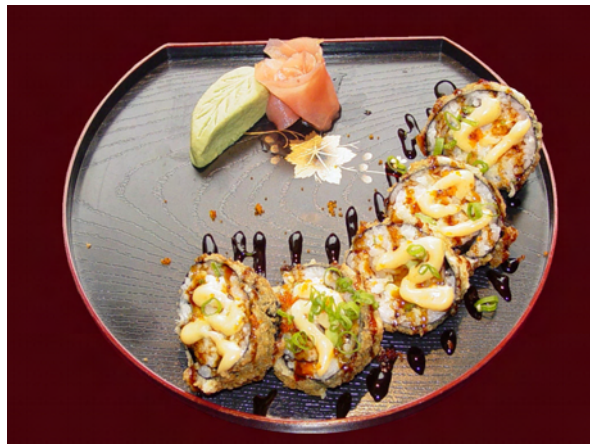
Amazing Crunchy Tuna/Salmon Roll

Red Sox Roll – Crab Stick, Avocado, Cucumber, and Tempura Flakes with Tuna on Top..... $10.95